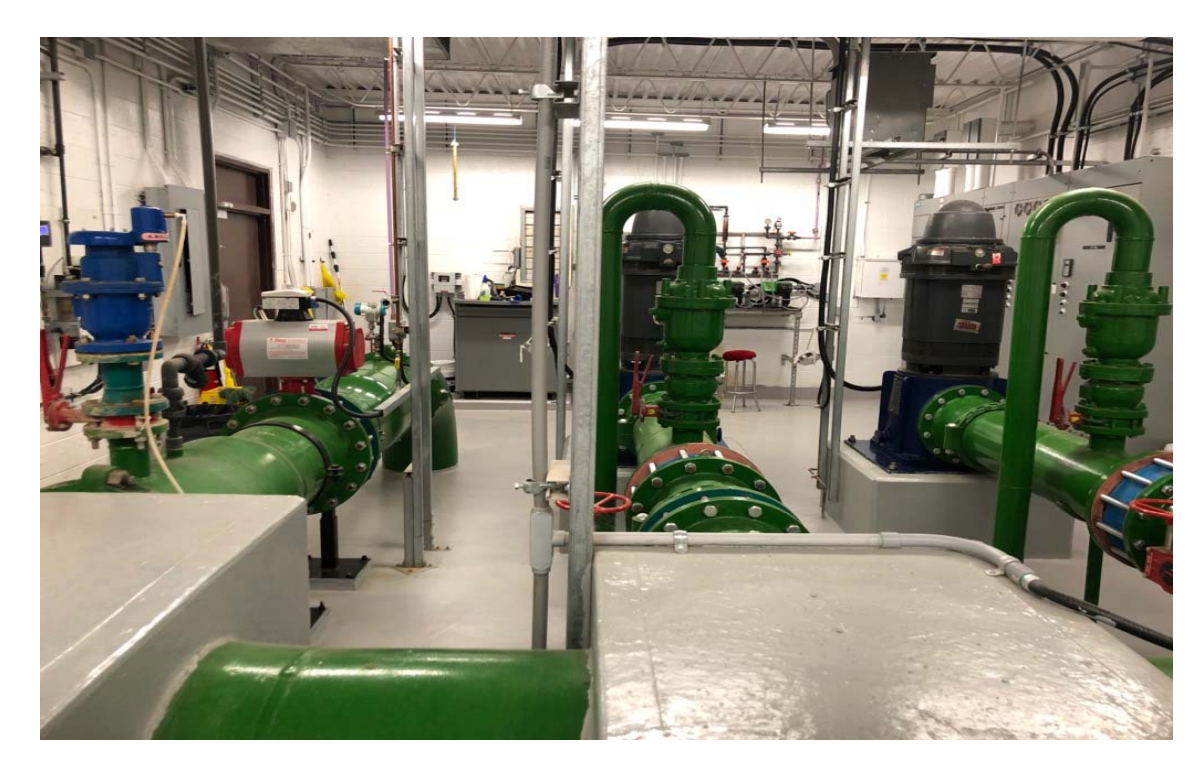
View from inside the Raw Water Pump house located at Lake Newell.